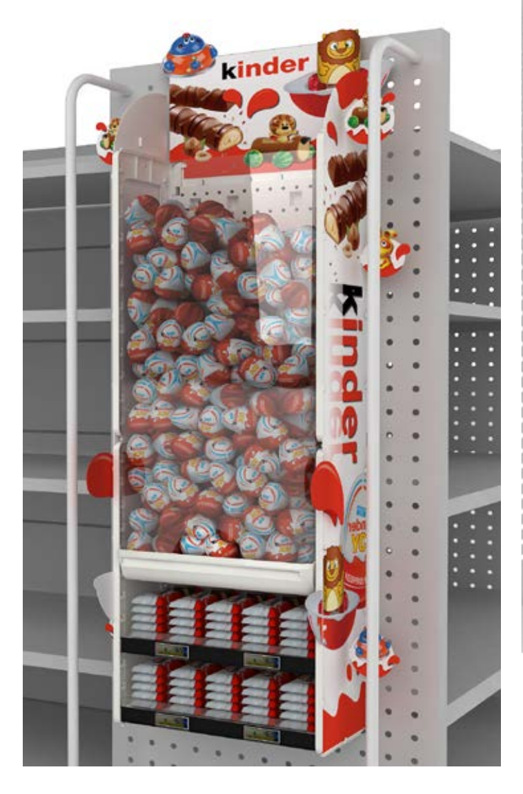
Double Gravity-Feed SideKick Max with branded cladding

*plastic pegs optional extra subject to minimum quantities. contact Kyta for more information